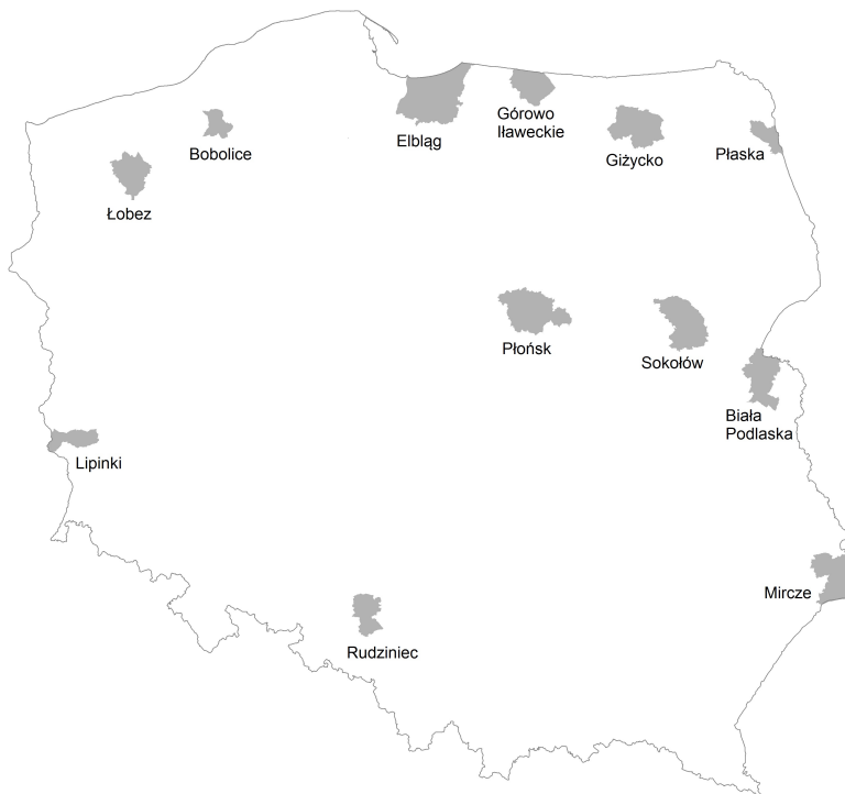
Fig. 1. Geographical layout of the Forests Districts where the test plots were located

[Forest Data Bank 2017]. In this work studies were conducted in the fresh broadleaved forest (FBF) and fresh mixed broadleaved forest (FMBF) habitat types. Fresh broadleaved forest (FBF) is a lowland forest habitat type (FHT) and it covers very fertile and fresh forest habitats. It is found on sites with brown soil, mainly leach, sometimes acidic or proper brown soil, proper lessive, with mull type humus or the typical mull. Fresh mixed broadleaved forest (FMBF) is a lowland forest habitat type (FHT) it covers fresh habitats of average fertility. It is found on brown leach, podzol or acidic soils, proper fawn soils, spodic, sometimes on podzoluvisols, proper podzol or rusty soils most of the time with typical humus.