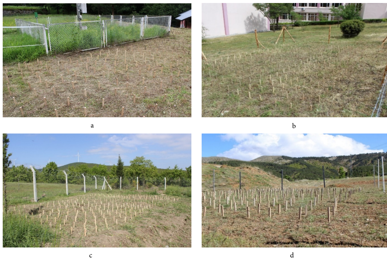
Fig. 1. Trial areas by province/region: a) Trabzon province, b) Muğla province, c) Çanakkale province, d) Elazığ province (Kiliç et al., 2023)

The experimental plots were selected based on their proximity to meteorological stations. In May 2016, samples were placed in experimental regions that were flat, free of weeds, homogeneous, well drained, secure, and protected from damage. The samples were buried in the soil to a depth of half their length (15 cm), spaced 30 cm apart and placed with their tangential sides facing south (Fig. 1). A total of 1500 samples were examined for this study: 600 sapwood, 600 impregnated sapwood and 300 heartwood. The numbers of test and control samples, together with the species and part of the wood from which they were taken, are listed in Table 1.